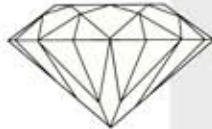
G H I J NEAR COLOURLESS