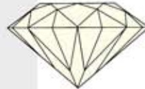
K L M FAINT YELLOW