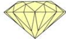
N O P LIGHT YELLOW